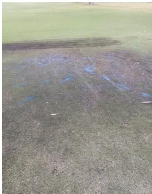
The old boggy turf