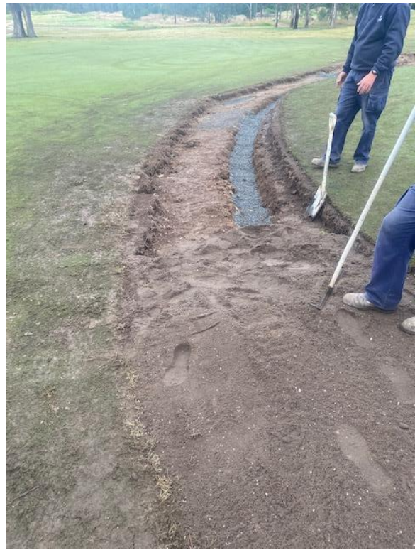
The new drainage line in front of green