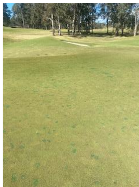
Winter grass targets with blue dots after being dabbed with paint brushes